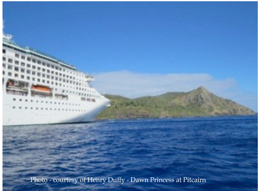
Dawn Princess at Pitcairn

A very enjoyable day and once ashore a number of provisions ordered by the community were distributed and everyone went home happy.