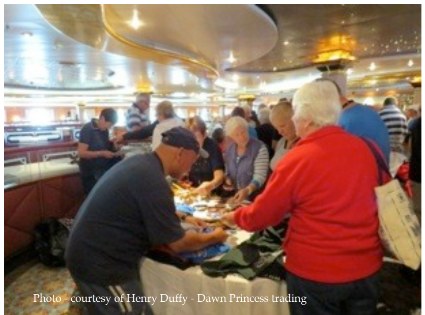
Dawn Princess trading