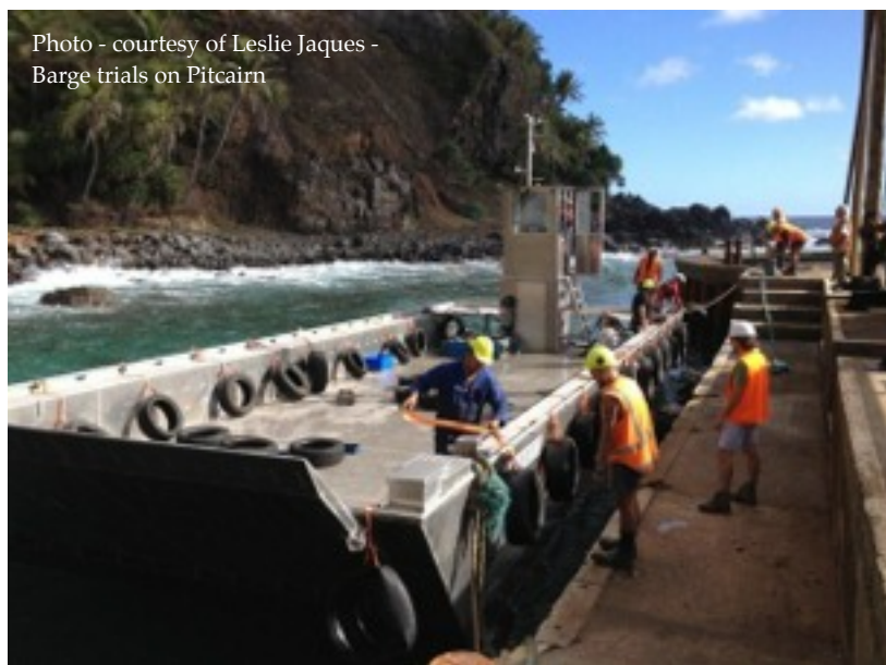
Barge trials on Pitcairn