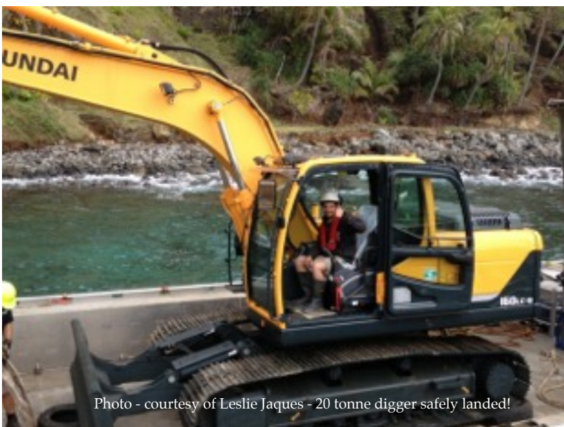
20 tonne digger safely landed!