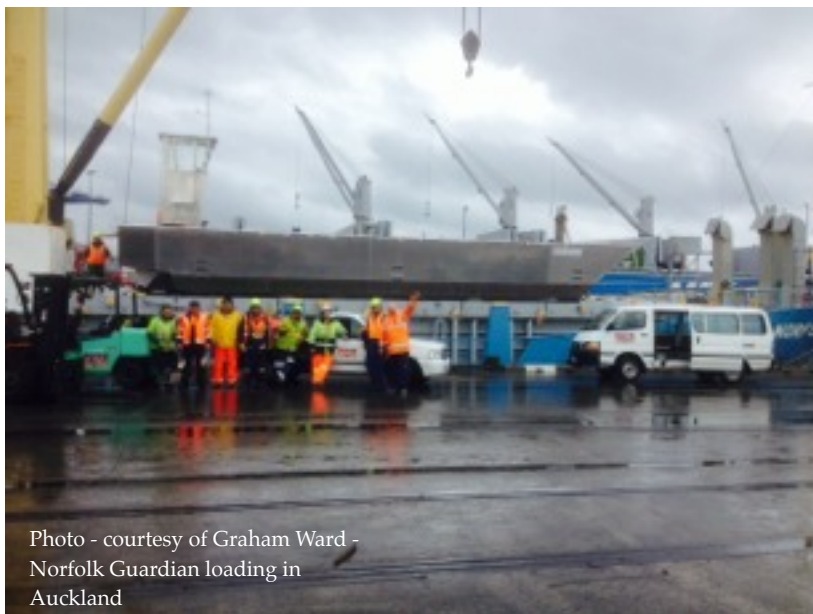
Norfolk Guardian loading in Auckland

August is traditionally a month of unpredictable weather with rough seas and high winds. Thus it was not surprising that when the Norfolk Guardian arrived, it was bad weather. This made it difficult and