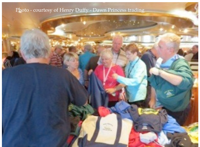
Dawn Princess trading