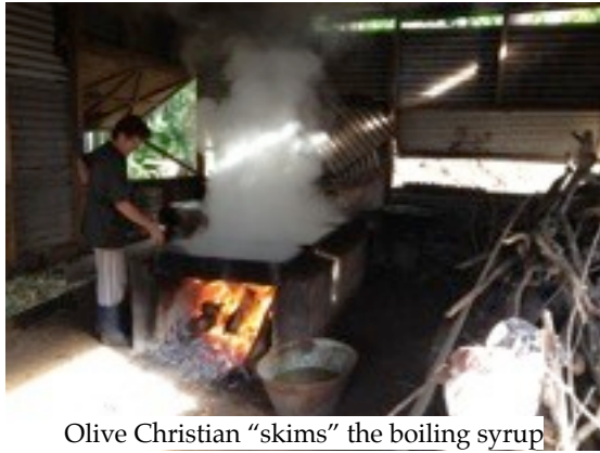
Olive Christian "skims" the boiling syrup

syrup will ferment and go off over time - or over-boiled to produce sugar. It is a real art and the fire temperature is to be monitored for a consistent boil. Molasses is eaten with Pitcairn dishes such as green banana pilhi, molasses cake, popcorn balls, as a hot drink, pancakes, to make Pitcairn sweets called "Lawle" or in place of commercial sweeteners. On the day of cane crushing it is traditionally thickened with arrowroot flour to make a sweet, gooey pudding ( a bit like phlegm!) and tasty sprinkled with freshly grated coconut and sliced ripe bananas. Two days and the equipment is all packed up for another season next year.