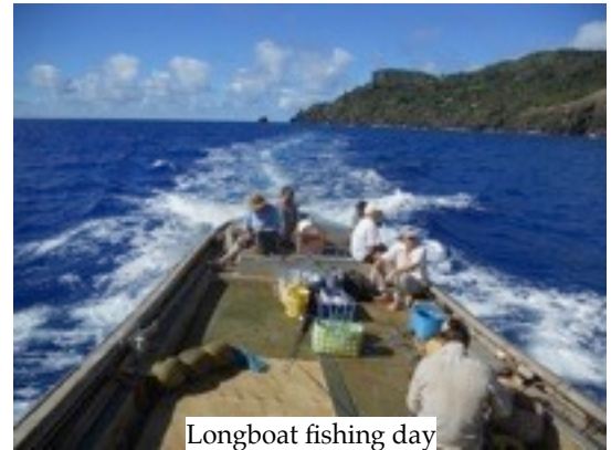
Longboat fishing day

the opportunity of people willing to part with their hard earned dollars in exchange for valuable fresh vegetables. Limited bags of tomatoes were snatched up as soon as Rodger declared that the market was open and fresh lettuce and bok choy disappeared into bags for happy shoppers to take home. Its great to have some fresh greens again. Such is the blessing of winter on Pitcairn.